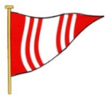
Stamford Yacht Club