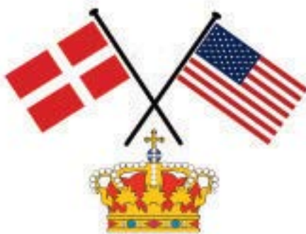
Royal Danish Yacht Club